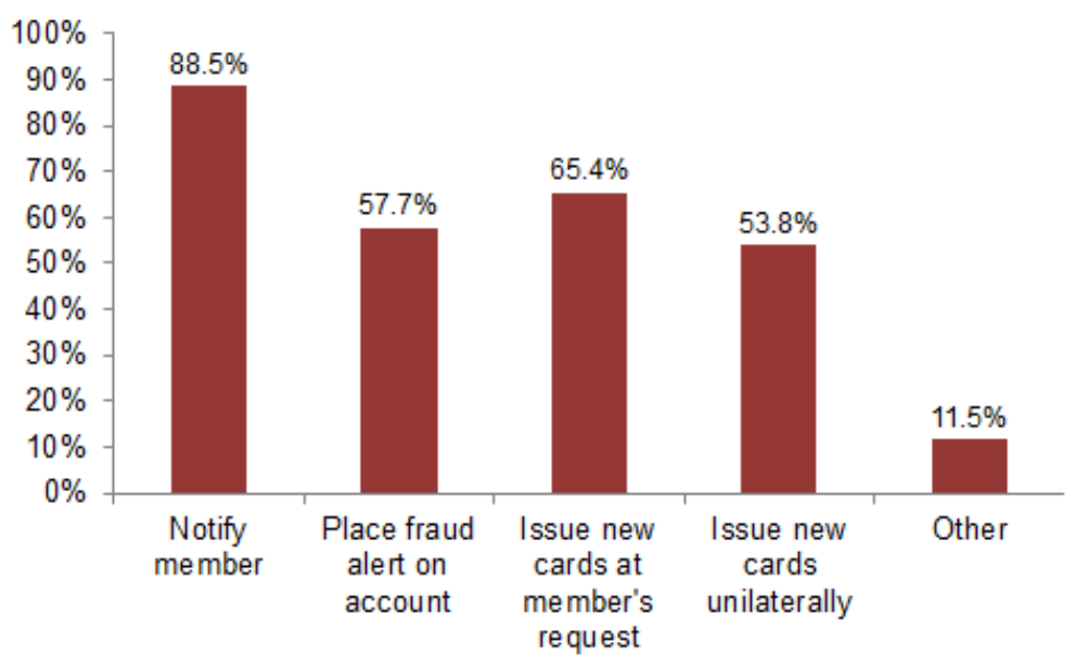
In response to 2014 merchant data breaches, what actions did you take?

Source: NAFCU Economic & CU Monitor survey